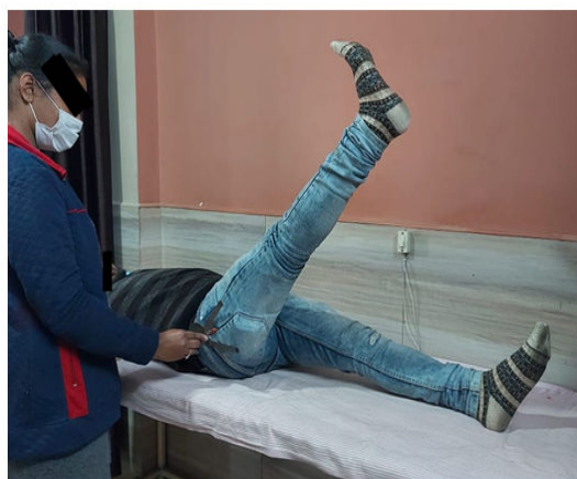
Figure 3. Active Straight leg raise test performed by the student.

Then, the subject bends down to the floor as low as possible while keeping the knees, arms, and fingers in full extension. If the tip of the middle finger could not reach the floor and had a distance of 5 cm or more, the test was considered positive and subject was confirmed for having short hamstrings. The distance from the tip of the middle finger and the floor was measured in centimeters with a measuring tape/ruler. Best of two trials was recorded. The Intra Class Correlation Coefficient (ICC) of the test was 0.99 [26]. Its validity and reliability has also been demonstrated in several other studies [27-29].