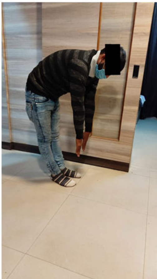
Figure 2. Toe touch test performed by the student.

Flexibility of hamstring muscle, which is a Superficial Back line structure, was calculated by using Toe Touch Test (TTT) (Figure 2) and active Straight Leg Raise Test (SLRT) (Figure 3) at baseline and post intervention. In Toe touch test, subject stands straight barefoot, with feet closer, and toes pointing forward.